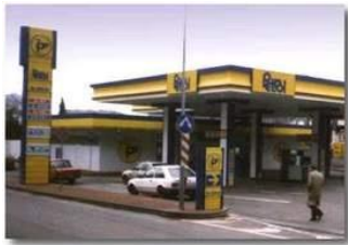
Petrol - Gas Station CCTV can benefit from digital technology

2- After a few seconds , he came back and told the girl she had to come inside because her credit card had been denied . Reluctantly , she walked inside . The old man grabbed her , but she hit him with a can of oil . Then , she ran back to her car and left the old man screaming and waving his arms at her . After driving for a few miles , she turned on the radio and started to relax . As she looked in the rear view mirror , she saw someone popped up at the back seat holding an axe above her head .