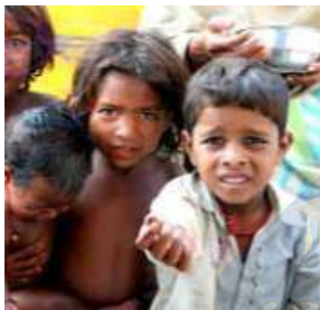
Street children begging

1/complete with information from the text (2pts)