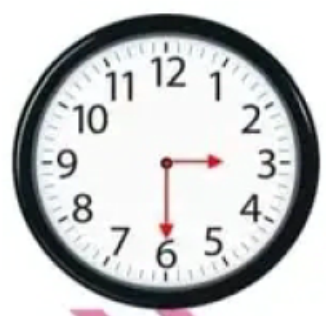
It's half past three

10 Write a paragraph about Nada's Sunday :