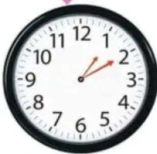
It's ten past one