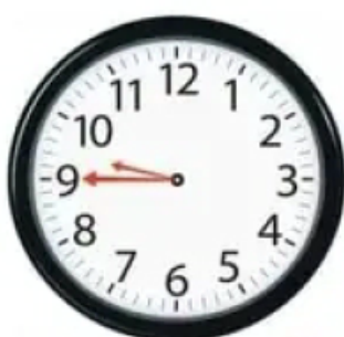
It's a quarter to ten