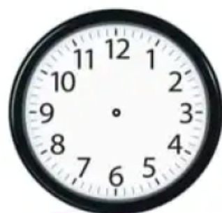
It's half past three

10 Write a paragraph about Nada's Sunday :