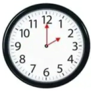
It's two o'clock

9 Draw the hands of the clocks to show the time indicated :