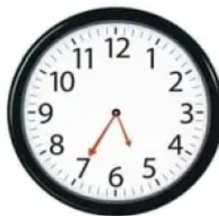
It's a twenty five to six