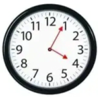
It's five past four